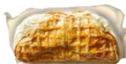
INDIVIDUALLY WRAPPED NORDIC WAFFLES