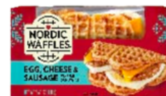
NORDIC WAFFLES BOXES