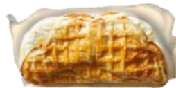
INDIVIDUALLY WRAPPED NORDIC WAFFLES