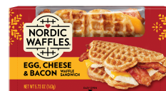
NORDIC WAFFLES BOXES